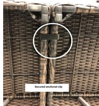
With ganging clip attached (underside view)