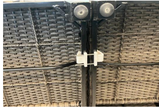
With ganging clip attached (underside view)